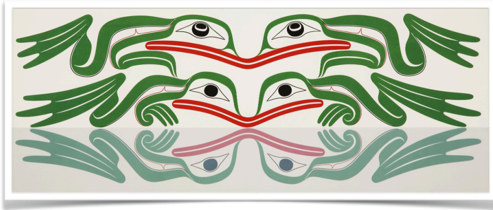
Robert Davidson Looking Back at Where We Came From , 2000

Does your location have this Robert Davidson's print? This print is part of the Artists for Kids editions.